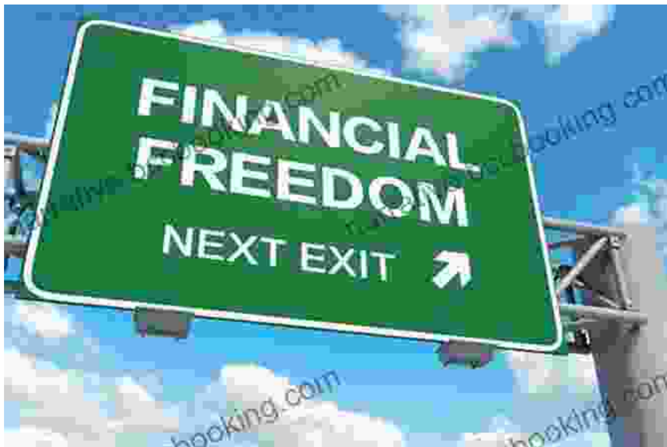
Image Alt Attributes

Together, we can use Bitcoin to help create a more just and equitable world.